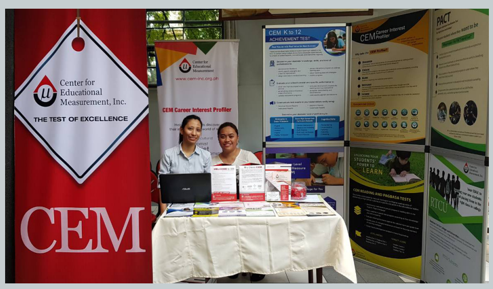
CEM Client Relations team manning the CEM booth during PEAC's INSET.

CEM is keen on supporting such initiatives as part of its continuing efforts to help improve the quality of Philippine education.