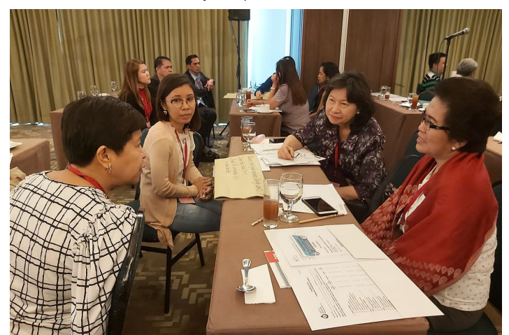
Participants during the group activity