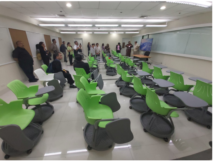
Participants during the E-classroom tour at the De La Salle University.